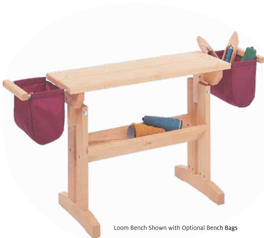
Loom Bench Shown with Optional Bench Bags