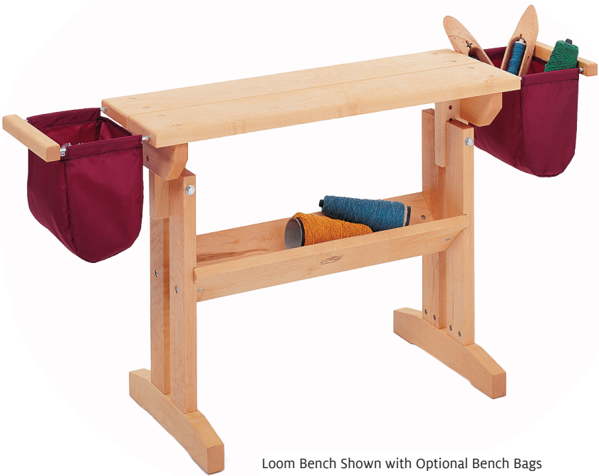
Loom Bench Shown with Optional Bench Bags